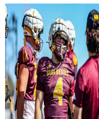
The rise of Guardian Caps: Protecting players, reducing concussions but facing pushback ( https://cronkitenews.azpbs.org/news/2019/02/26/guardian-caps-gain-traction-in-college-football/ )