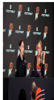
Diana Taurasi ponders future, Sophie Cunningham signs extension as Phoenix Mercury brace for WNBA playoffs ( https://cronkitenews.azpbs.org/news/2019/02/26/taurasi-future-sophie-cunningham-signs-extension-as-phoenix-mercury-brace-for-wnba-playoffs/ )

“This is what’s right for our American people and what is right for our country,” she said after the veto.